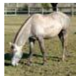
Blue = 5