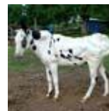
Jasper = 9