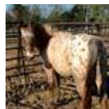
Sand Dollar = 6