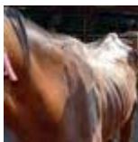
Marco = 1

The Chart rates the horses on a scale of 1 to 9. A score of 1 is considered poor or emaciated with no body fat. A 9 is extremely fat or obese. Horse veterinarians consider a body score of between 4 and 7 as acceptable. A 5 is considered ideal.