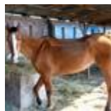
Maggie = 2